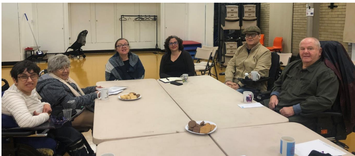
Photo: A few of the members at our Craftivism and Chat Group, who got involved in the consultation response.

We would like to thank our members who helped us respond to this consultation via our Craftivism and Chat Group 2 , and everyone who took the time to respond separately too.